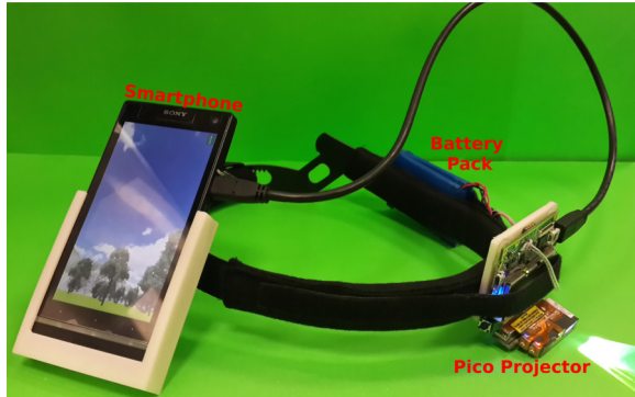
Figure 3. A photograph of the hardware device, equipped with a smartphone, a battery and a pico projector. The housing for both items is in-house 3D printed.