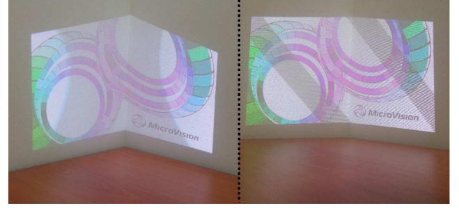
Figure 4. Left: A photograph of the visible key-distortion problem when the separation between the camera and the projector is high. Right: This photograph shows that there is no visible key-distortion effect when the camera is placed close to the pico projector, although the surface is curved.