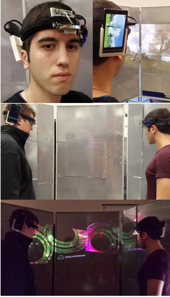
Figure 2. The top picture shows two different photographs of a user with our wearable augmented reality display, the system is composed of a smartphone, an external battery and a pico projector with 3D printed housings. The two photographs (middle and bottom) are showing a scenario where multiple users independently taking benefit of a passive retro-reflective screen without crosstalk.